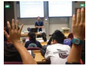
An engaging presentation to conference attendees

They brought much vibrancy, enthusiasm and spontaneity to our session, which comprise a volunteer recruitment drive and a sharing of the current drug situation in Singapore. SANA would be working with three groups of young people, and we are definitely looking forward to this wonderful partnership opportunity with these young budding leaders!