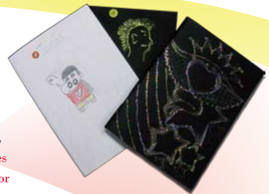
The participants designed their own journals, a place where they can express their thoughts and emotions

After the successful completion of the pilot run in the first quarter this year, the SMART programme commenced its second run on 11 July 2009 with added improvement to the programme content. Greatly encouraged by the attendance of parents in our previous run, we were able to include more opportunities for them to join their children in the outdoor activities , for greater synergy and bonding in the learning process. We would like to wish the youth and parents all the best in their journey through the SMART programme, and to give our thanks to our volunteers for supporting SANA's team of counsellors.