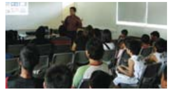
Youths at T-Net Club learning about dangers of drug abuse

To create greater awareness on the dangers of drug and inhalant abuse, an anti-drug talk was jointly organized by the Macpherson Drug Abuse Prevention Committee