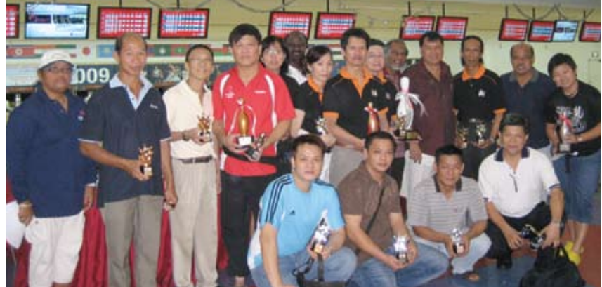
Winners at Poh Geok Ek Challenge Trophy Bowling Tournament Saturday 5 Dec 2009 @ Orchid Country Club