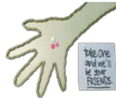
Drug Story (PLMGSS)

Catch the winning podcasts at www.sana.org.sg