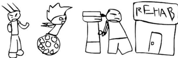
A Close Encounter with Drugs (Zhonghua Sec)