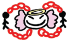
Drug Lesson (PLMGSS)