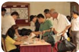
Registration followed by Lunch

SANA Charity Golf was held on 29 September 2009 at Orchid Country Club this year. We would like to thank Dr Vivian Balakrishnan , Minister for Community Development, Youth and Sports, for gracing the occasion as the Guest-of-Honour.