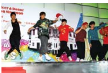
Finalists from Danceworks bring action to the fore front