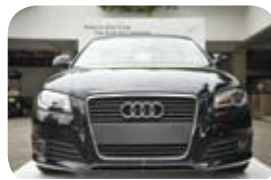
We thank Audi Singapore for sponsoring the prestigious Hole-in-One prize

Golfers, sponsors and donors, thank you for the strong support in making this event a success! Thank you again.