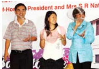
Back to the Past with Bubble Competition