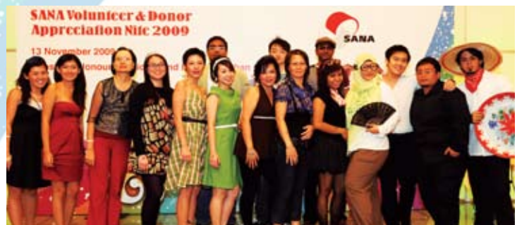
Smells like Team Spirit

A dream you dream alone is only a dream. A dream you dream together is reality. -John Lennon