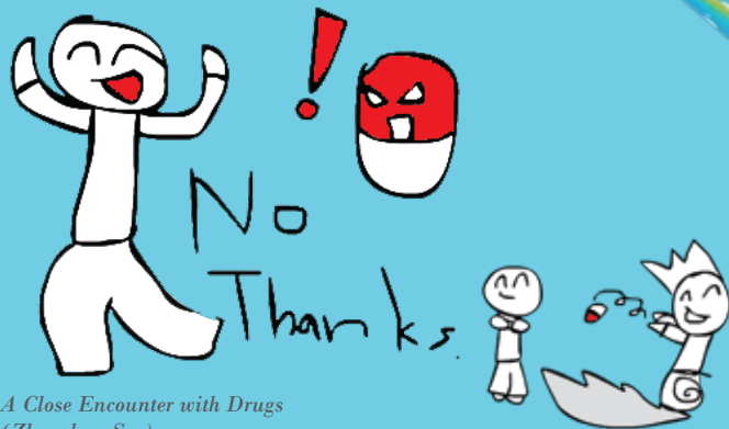
A Close Encounter with Drugs (Zhonghua Sec)

In the meantime, check out how we have wrapped up 2009 with some 'edu-tainment' for the kids and plenty of family fun!