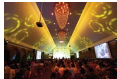
In the mood for SANA Nite Fever